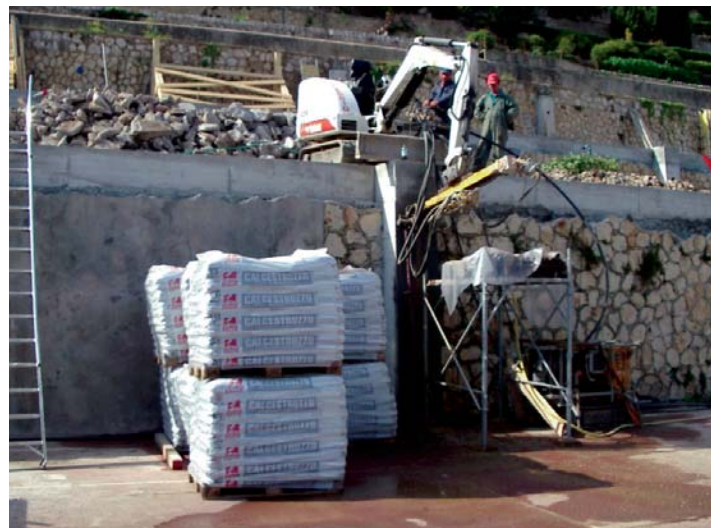
Terracings built with retaining walls made of structural FIBRE - REINFORCED CONCRETE .

The instructions and warnings set out on this sheet arise from our best experience and product performance refers to laboratory tests carried out in standardised conditions. All this information should be considered as purely indicative since the real site and application conditions of the product may lead to significantly different effects and results. Therefore the user must always check, even through preliminary tests, the suitability of the product with the intended use, undertaking all liability for the use they make. GRAS CALCE spa reserves the right to make technical changes without prior notice. Check the GRAS CALCE spa website to ensure the sheet revision is the one currently in force.