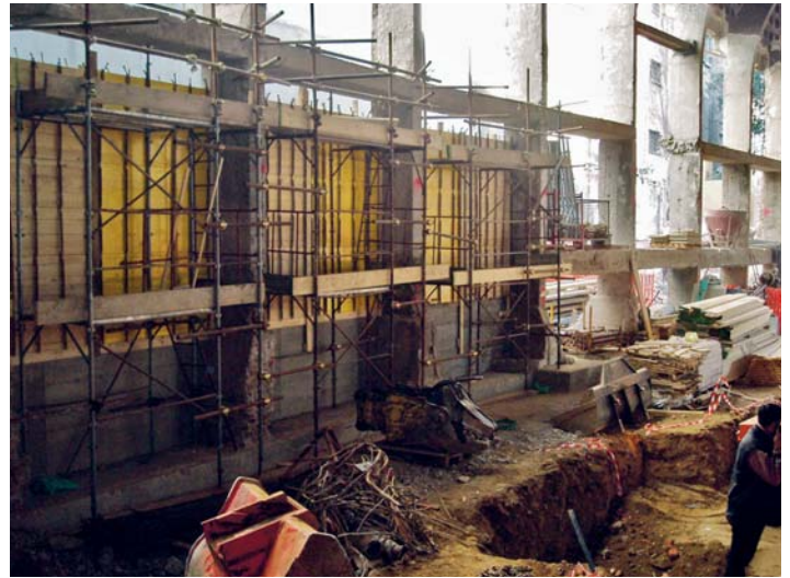
Earth retaining walls built with FIBRE - REINFORCED CONCRETE for the restoration of a commercial space in Milan.